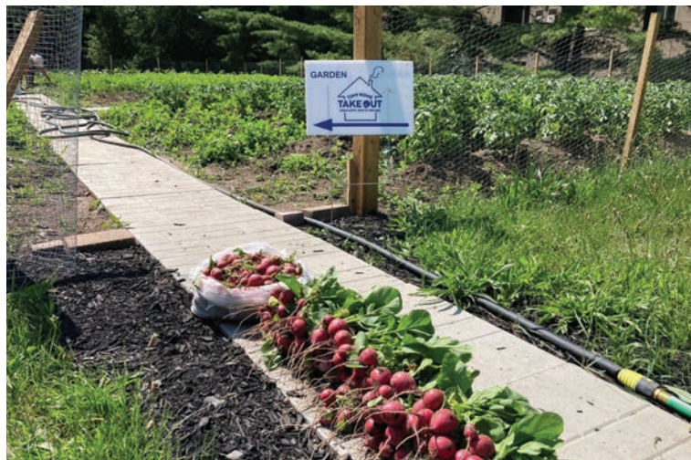
Some of the produce gathered to be used in the Tiny Home Takeout kitchen

Ma, Fr. Toby & myself. A wide variety of vegetables was planted: beans, peas, carrots, potatoes, tomatoes, squash, zucchini, leeks, kale, beets, radishes ...and more!