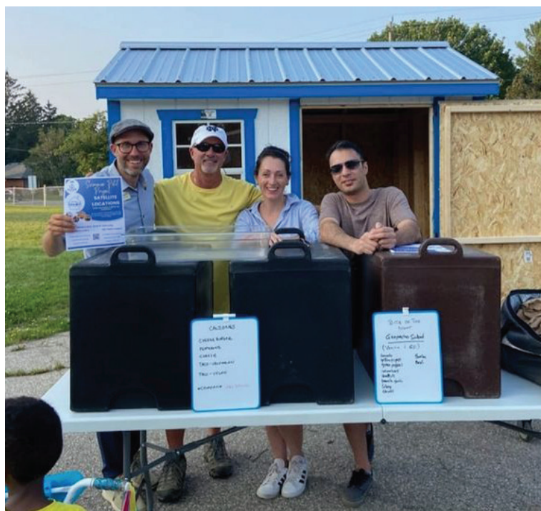
New satellite for Tiny Home Takeout

May the rains fall gently on our garden!