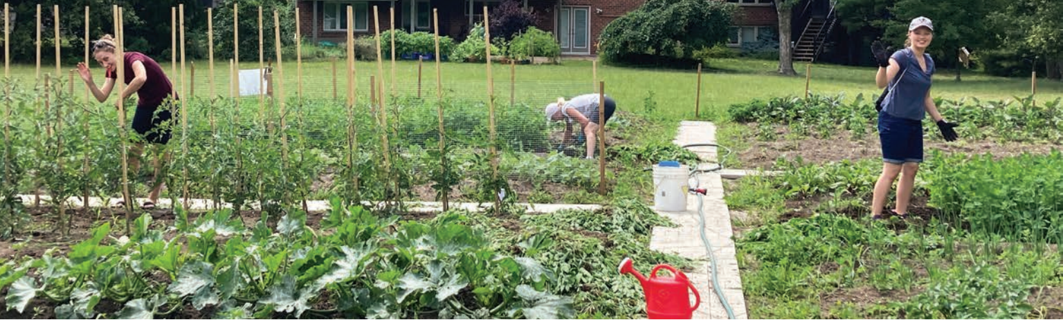
Volunteers work in the garden, gathering the fruits of their labours

everyone in downtown Kitchener, especially those in most need.