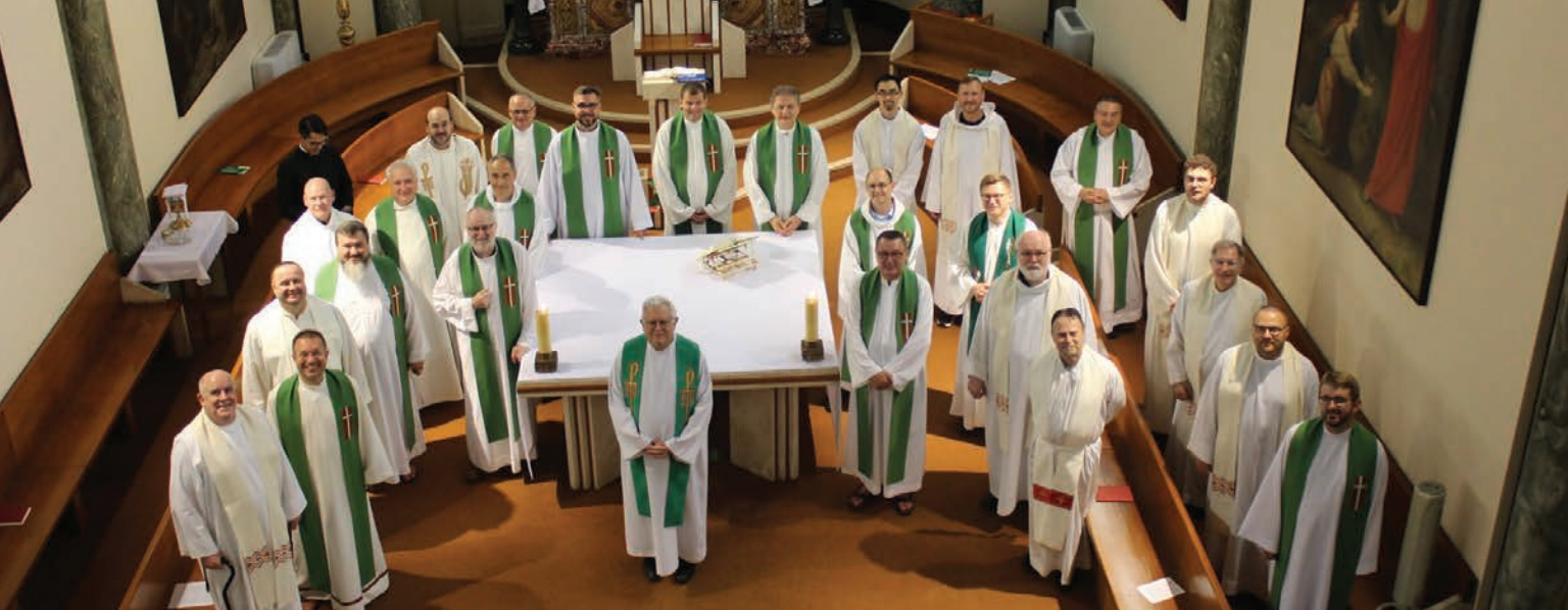
Resurrectionist Delegates at the Thirty-Fourth General Chapter