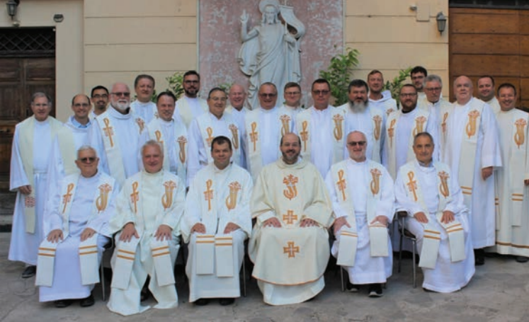
Delegates of the General Chapter

This was, indeed, an important event in the life of the Congregation of the Resurrection, and we are grateful for the many people – our brother Resurrectionists, Cardinals, Archbishops/Bishops, Religious Sisters, and laity – who accompanied us with their prayers. We believe the Holy Spirit led and guided us in the Thirty-Fourth General Chapter of the Congregation of the Resurrection! Alleluia!