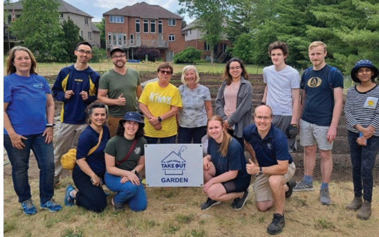
Volunteers who made the community garden a reality