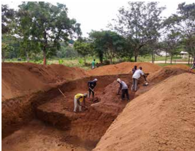
Digging the hole for the new water tank by hand.