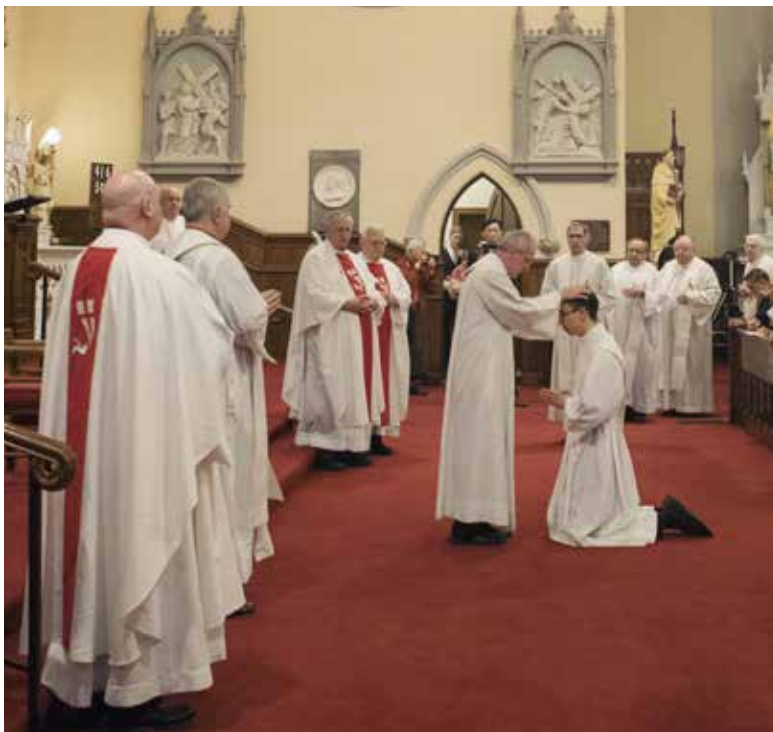
The laying on of hands during the ordination ceremony.