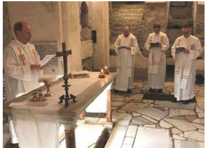
Resurrectionists renewing vows in the Catacombs of St. Sebastian, the site where the founders professed their vows on Easter Sunday morning, 1842.