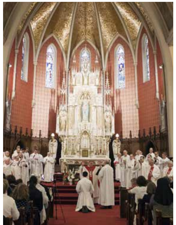
The prayer of ordination.