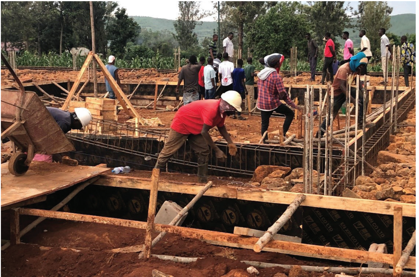
All labour is done by hand

cement, and sand, build railings and casings, and mix and pour cement. By the end of December, they had already begun the scaffolding to construct the second floor of the building.