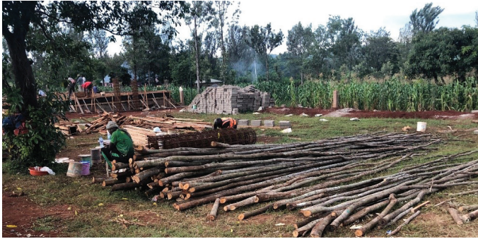
Construction materials are prepared for construction

It takes much preparation to assemble the materials needed for the construction.