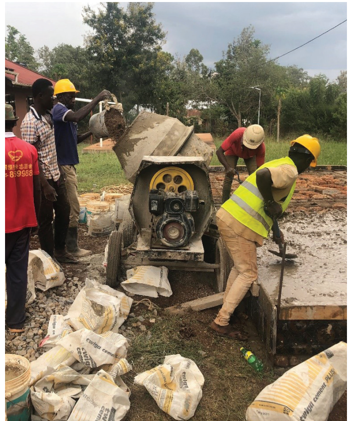
Construction of the new kitchen for the Novitiate

roof awning. We are looking forward to the novitiate and to this new addition to help us in the formation of future Resurrectionists.