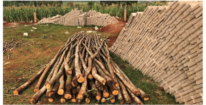
Assembled construction materials for the new school

Besides trucks that deliver the cement, sand, stones, and wood, all the labor is done by hand. There are about fifty workers who dig foundations, hammer wood, carry stones,