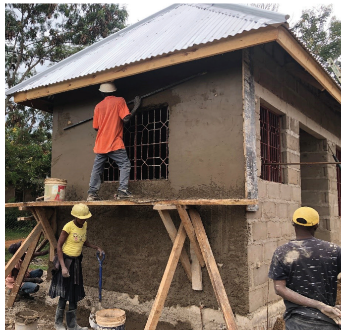
Construction is progressing nicely!