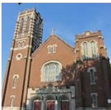
St. Cecilia Church in Louisville, Kentucky, once under the jurisdiction of the Ontario-Kentucky (Canadian) Province

After the end of World War II in 1945, the Church and religious communities experienced a period of growth and spiritual development, and this was true for the Congregation of the Resurrection. The membership of the Congregation totalled 379 members at that time, with 266 priests, 48 major seminarians, 44 brothers, 21 novices and postulants. A General Chapter was convoked in Rome on June 18, 1947, with delegates from Europe, Canada and the United