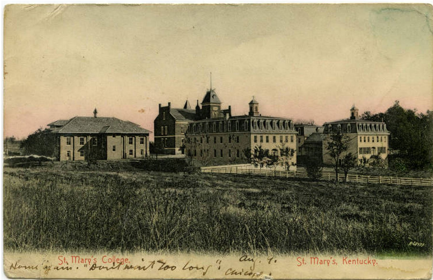
St. Mary's College, Kentucky