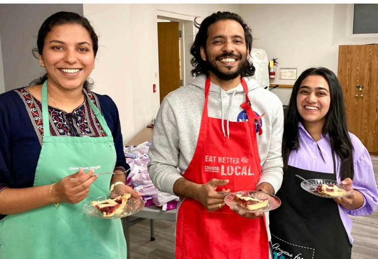
Participants enjoying Loaves & Laughter