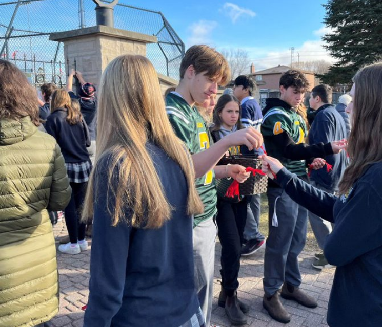
Students tied red ribbons at the gate of Cundari Field at St. Joseph-Scollard Hall School

on the highway near Burks Falls, south of North Bay. He was 52 years of age. On the 37th anniversary of his death, students tied red ribbons at the gate of St. Joseph-Scollard Hall Cundari Field, the field dedicated to him in 2015.