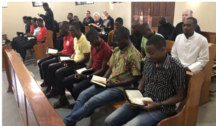
A crowded chapel of seminarians and aspirants