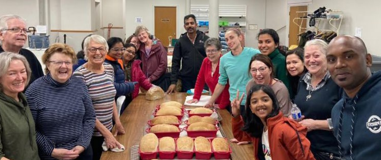
The finished product. Another successful evening of breadmaking!

Not at all. What I've witnessed is a program that brings lots of joy to people from different backgrounds and in various stages of life. It's never quite the same group that gathers on Fridays, but the enthusiasm at the beginning of the night, the laughter throughout the event, and the gratitude on people's faces as they leave with a freshly baked loaf of bread ...these are consistent. What may have begun with a bakery at the end of its 'life cycle' has – I believe through the Holy Spirit – been resurrected, given new life.