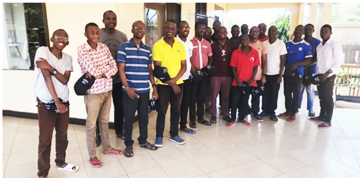
Thank God for the abundance of vocations

The seminarians in their second and third year are required to finish a fourth year of Theology before their pastoral year. Because of a change at Jordan University College, those who began their first year in Theology this year will only have three years of Theology, followed by their pastoral year.